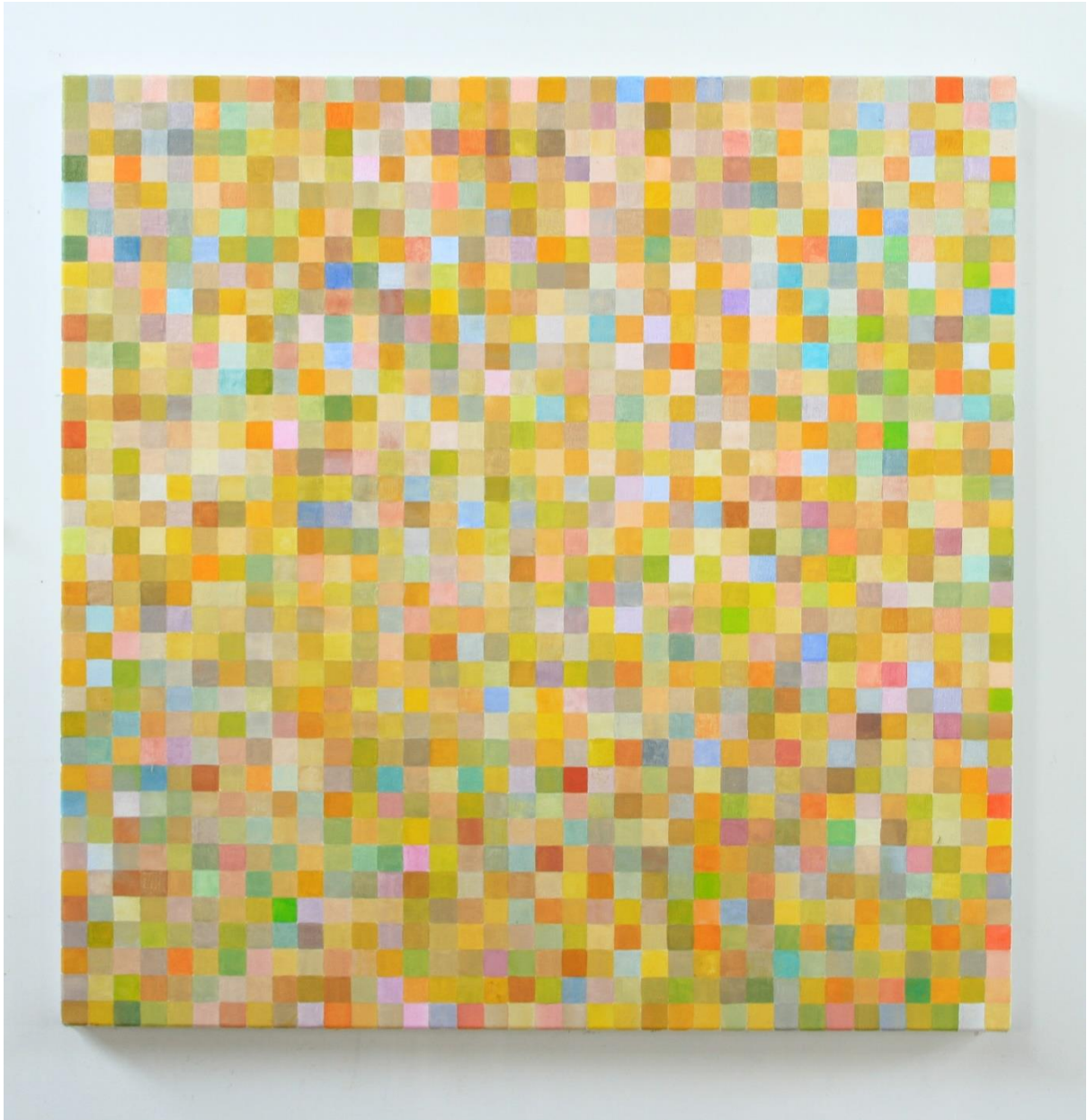
Eric Hongisto, 1x1x36 Acrylic on Canvas, each 36" x 36", 2017