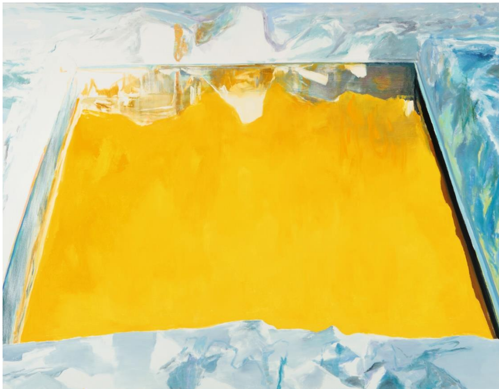
Eric Aho , Ice Cut (Arctic Sky) , 2015

Oil on linen, 74 x 95 ½ inches, 188 x 242.5 cm